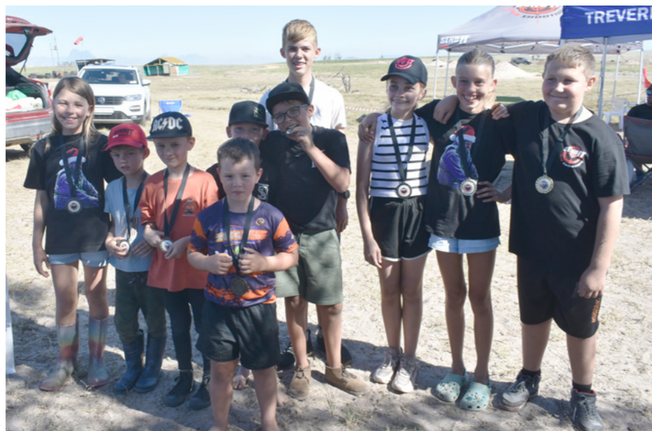
1 ALL the Juniors.